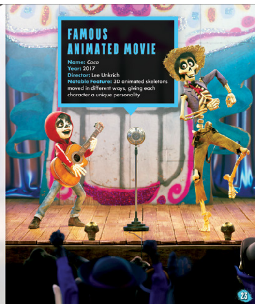
Sample spread from Animation